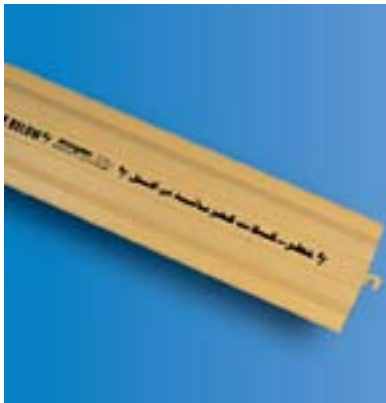
PVC CABLE TILES