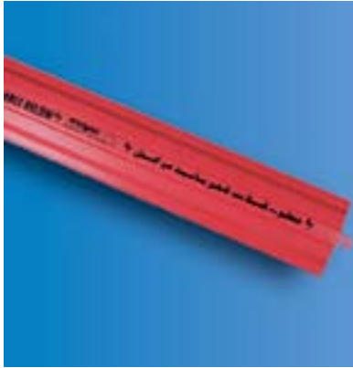
PVC CABLE TILES

INTERGARD rigid PVC cable tiles are specially profiled with lengthwise rigidity, and are manufactured from extra tough super high impact PVC compound which is suitable for use in all ground conditions. Being bright, self coloured and robust, INTERGARD tiles are particularly suitable as protective and warning markers for buried electrical and telecommunication cables as well as for underground water or energy pipelines.